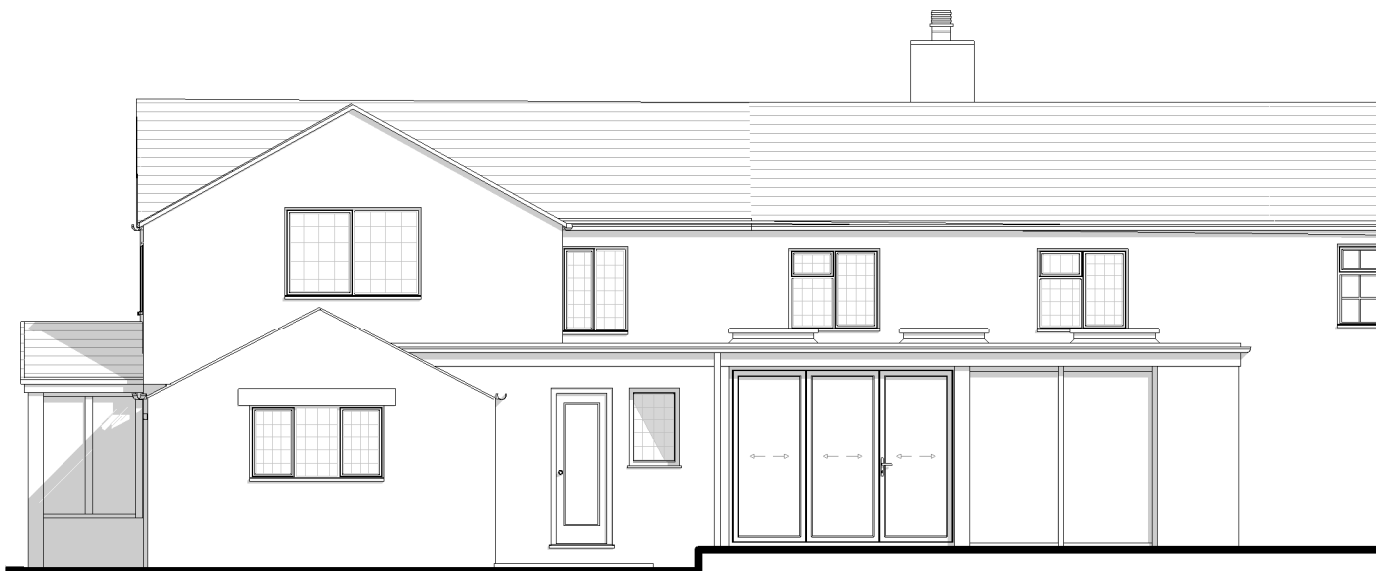
Proposed South Elevation 1 : 100