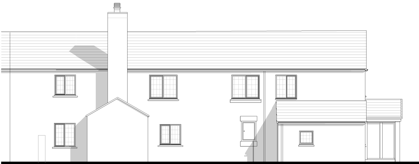
Proposed North Elevation 1 : 100