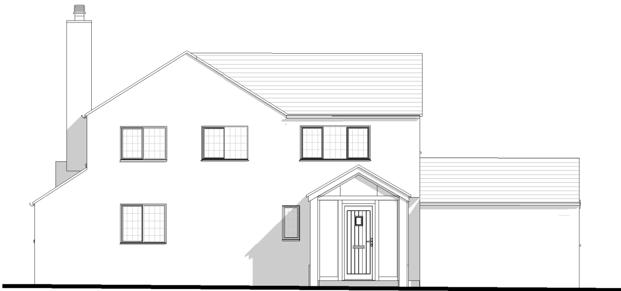
Proposed West Elevation 1 : 100