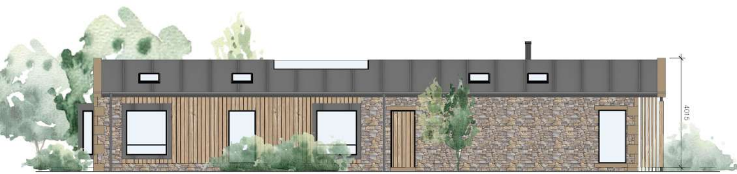
PROPOSED NORTH ELEVATION 1 Scale 1:100