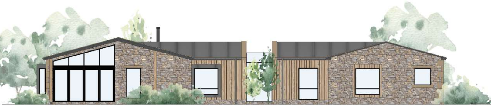
PROPOSED WEST ELEVATION Scale 1:100