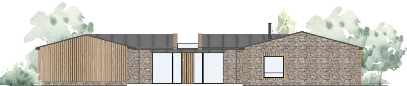
PROPOSED EAST ELEVATION Scale 1:100