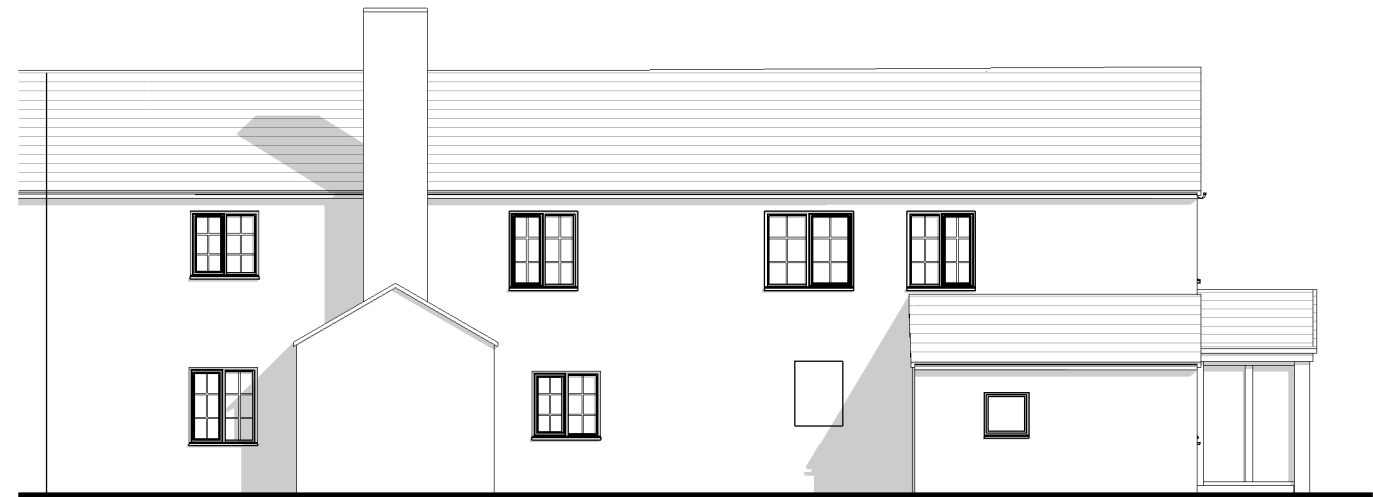
Proposed North Elevation 1 : 100