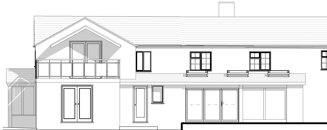
Proposed South Elevation 1 : 100