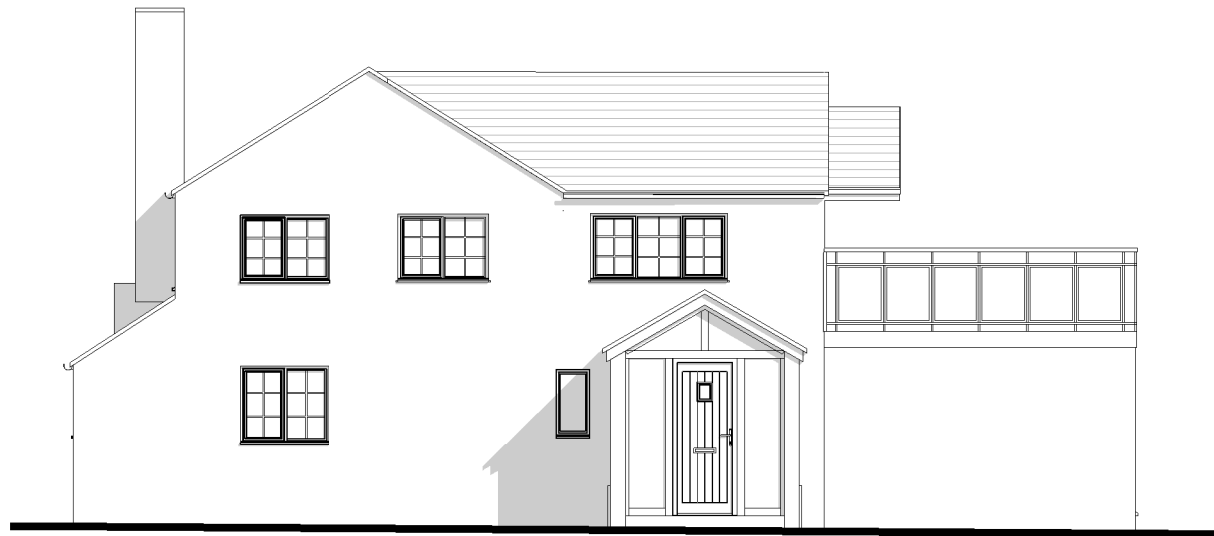
Proposed West Elevation 1 : 100